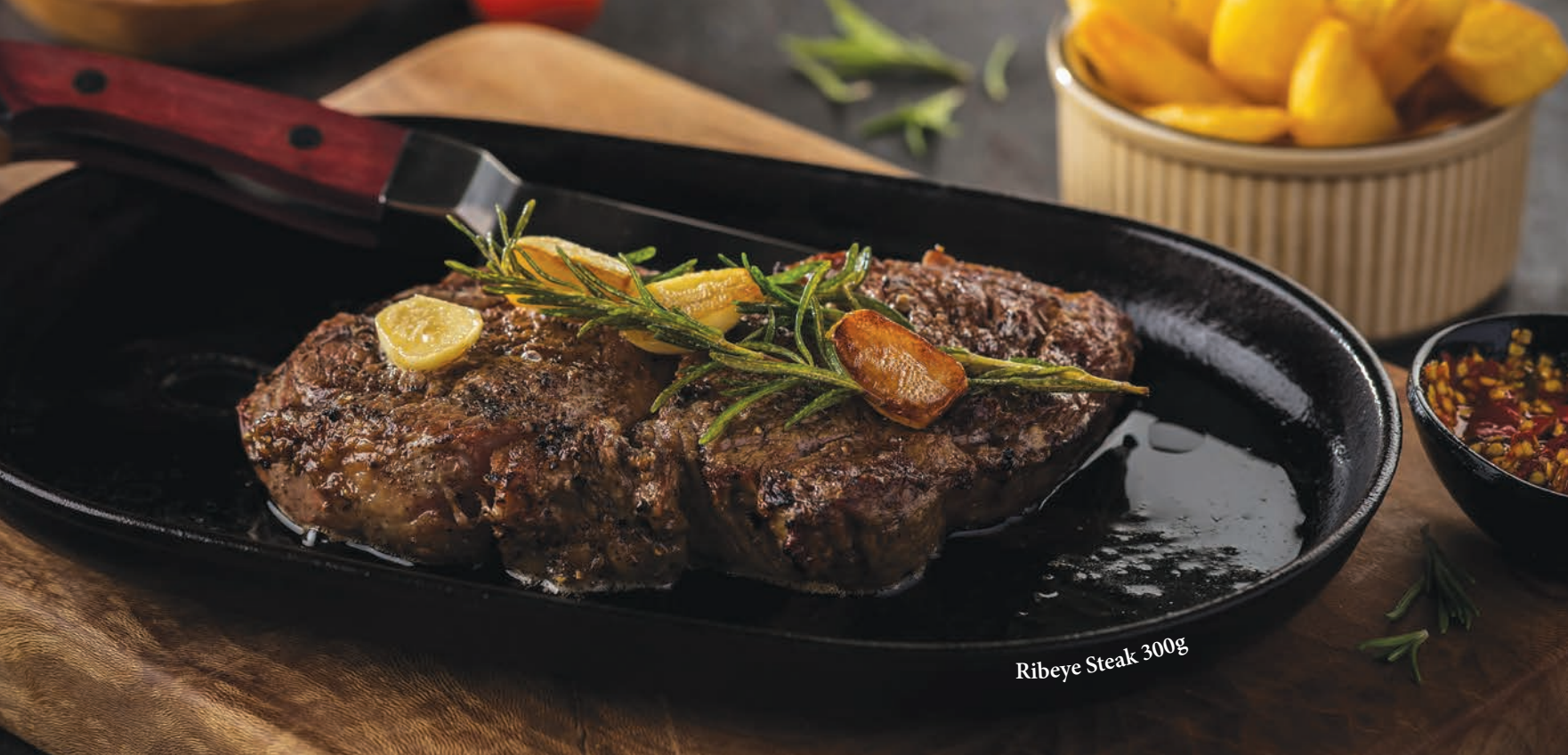
Ribeye Steak 300g

Crafted for bold flavour and perfect tenderness.