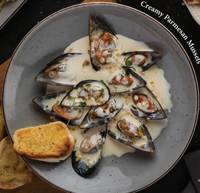
Creamy Parmesan Mussels